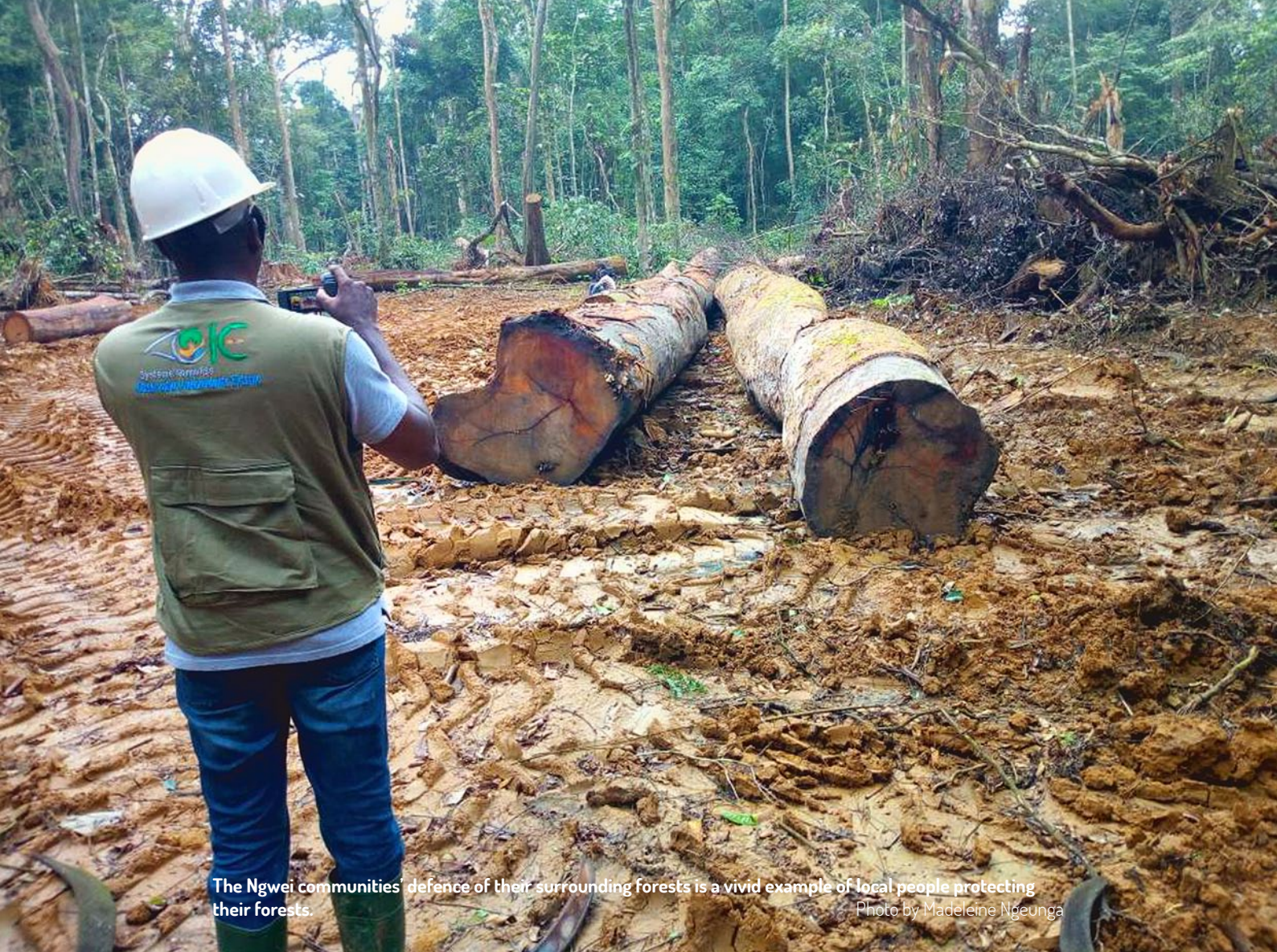
The Ngwei communities' defence of their surrounding forests is a vivid example of local people protecting their forests.

Ngwei, Cameroon The village elders call it SUHE . In forestry, specialists call it Faro . This brown wood found in tropical climes, including the forests of Ngwei, in Cameroon's Littoral region, contains numerous therapeutic properties according to locals.