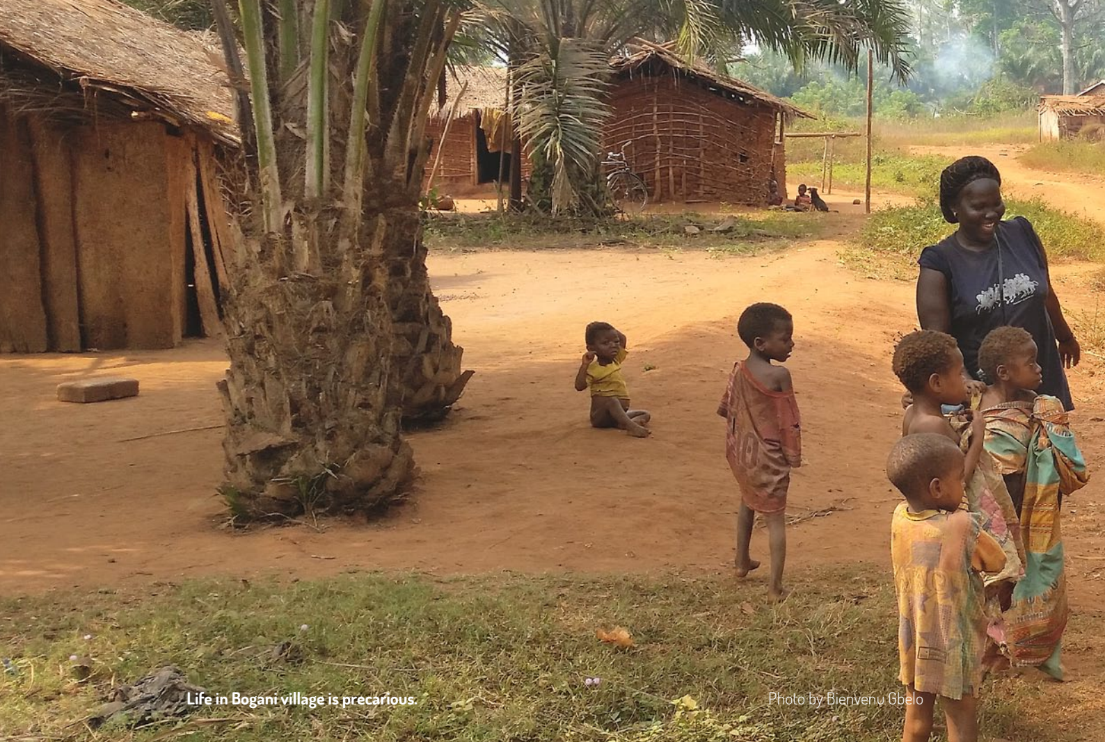
Life in Bogani village is precarious.