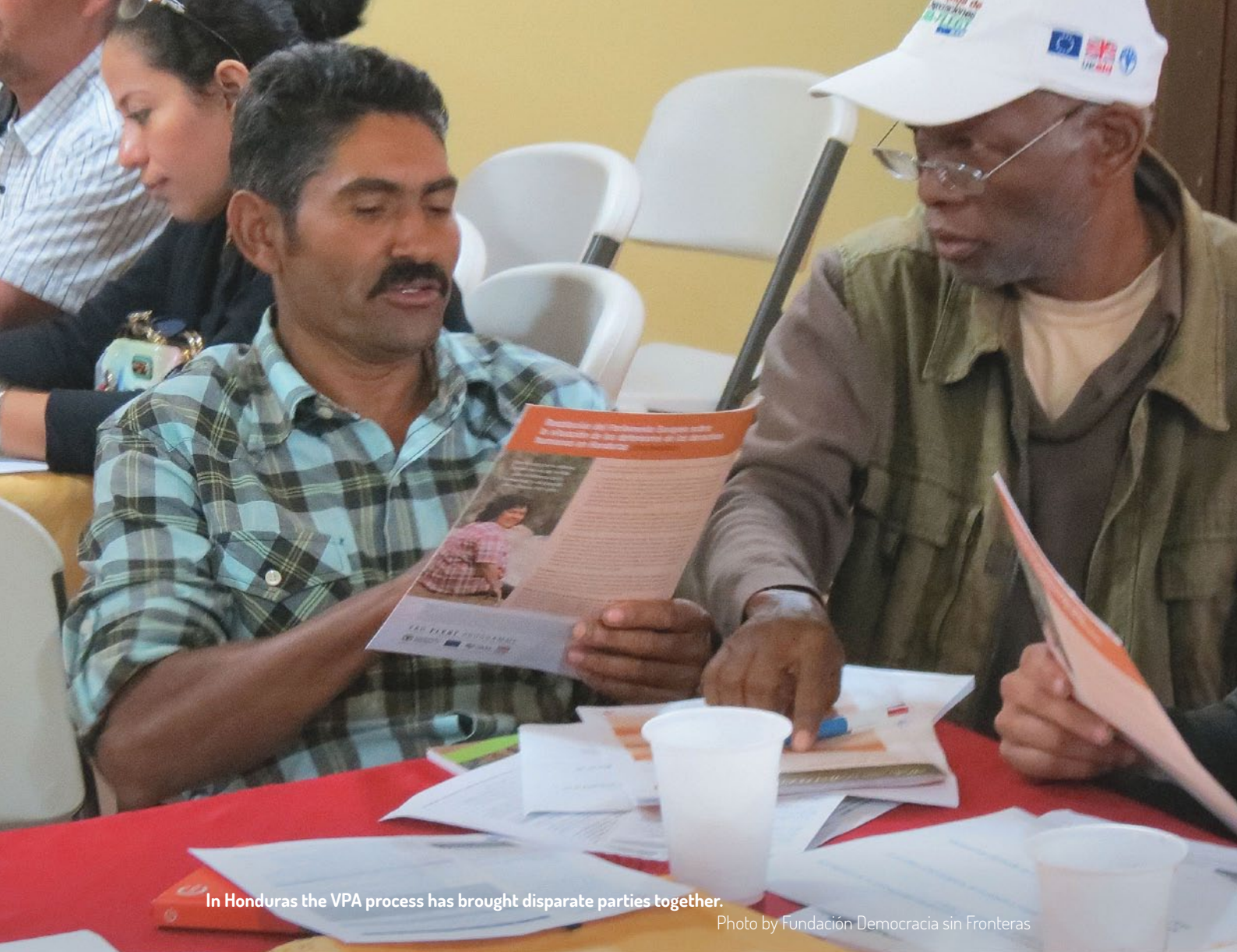
In Honduras the VPA process has brought disparate parties together.