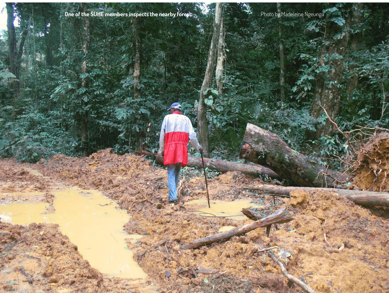
One of the SUHE members inspects the nearby forest.

In 2013, Ngwei residents first made contact with FODER, who have since helped train SUHE members, investing them with the knowledge and skills to better protect their forests.